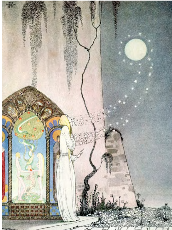
Image by Kay Nielsen, (1816-1957)